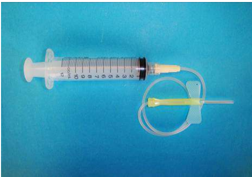
Combination of Butterfly and Syringe Systems