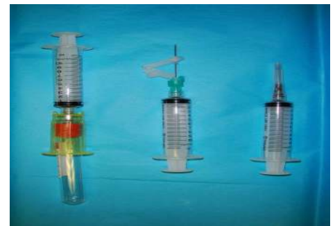
Left to right: Syringe Transfer Device, Engineered Safety Device and Luer-lock needle and assembly