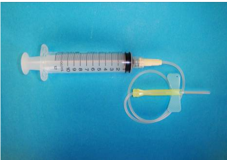
Combination of Butterfly and Syringe Systems

These facilities include spacious classrooms that include blood draw stations, fully equipped and designed for students to simulate on-the-job training. These stations can include phlebotomy chairs equipped with lock-in mechanisms to prevent falling and all necessary equipment and supplies required to perform phlebotomy procedures like antiseptic, gauze, Sharps container, tourniquets, vacutainer tubes, lancets, winged infusion sets, vacutainer needles and hubs, and personal protective equipment.