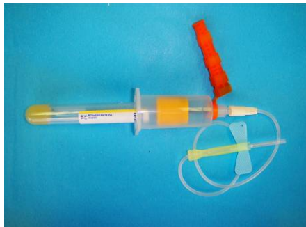
Combination of Butterfly and ETS System